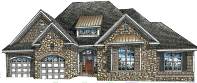
7330 N. Beau Avenue, Milw

WOW! $370,000 Including Finished Lower Level